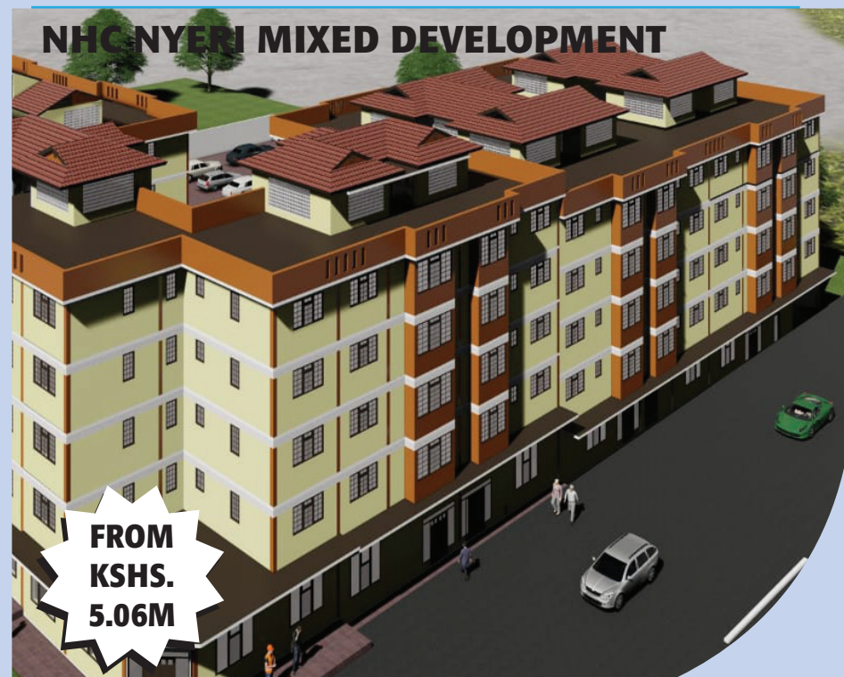
NHC NYERI MIXED DEVELOPMENT

Spacious rooms | Master en suite | High quality built-in cabinets and wardrobes | Cabro car parking |