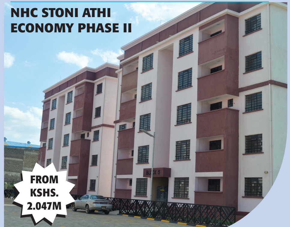
NHC STONI ATHI ECONOMY PHASE II

4 BR. Maisonettes in Athi River for Sale on Tenant Purchase and Outright Sale Terms