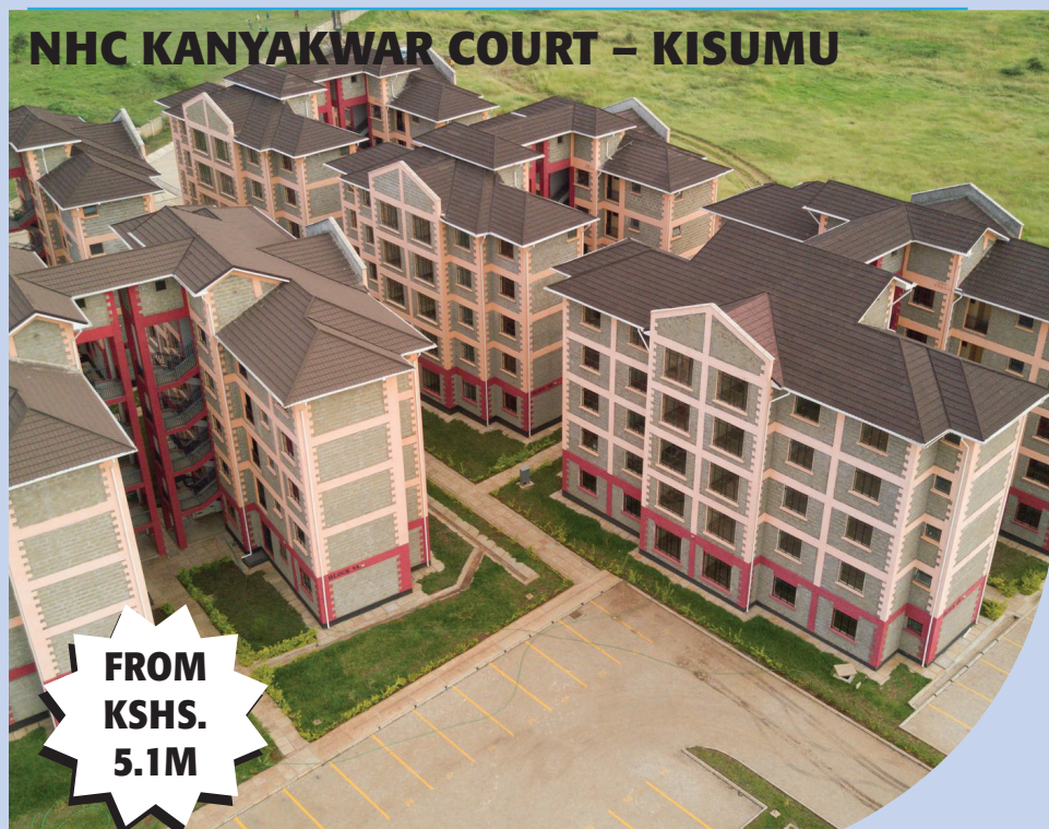
NHC KANYAKWAR COURT – KISUMU