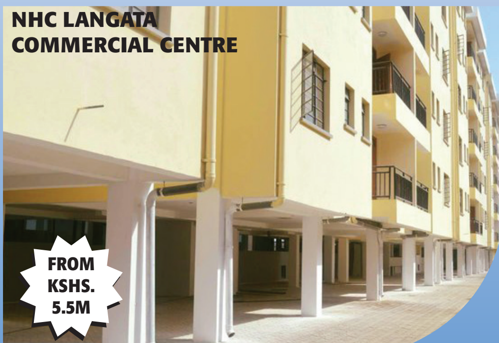
NHC LANGATA COMMERCIAL CENTRE

Spacious rooms | Borehole | Ample parking | Internet infrastructure | Paving Slabs walkways | Water treatment plant |