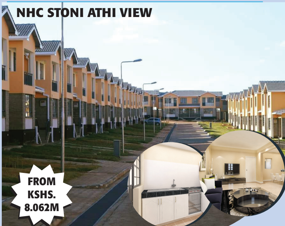
NHC STONI ATHI VIEW